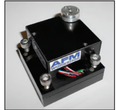
PS-2011 scanner with leveling sample puck.